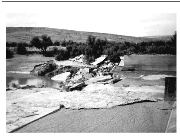
Photograph 3. Deliberately destroyed diversion weir in Anambar Plain, Pakistan: ours, 1997

As to the example from Pakistan, in Anambar Plain in Balochistan, one of the introduced modern weirs significantly changed the indigenous water distribution system. The weir was constructed to divert spate flows to upstream fields. It performed this function, but also considerably reduced the base flow to the downstream fields. This deprived the downstream farmers of their basic access to water granted to them by the water rules that had been implemented for years. Essentially, the design was made with a major oversight as to the prevailing water distribution rules. Hence, the weir became the main cause for many tensions and conflicts. Unlike in the Yemen case, the upstream community, faced with an equally socio-economically powerful downstream community, did not manage to maintain the water control power offered to it by the weir and did not shift from food crops to highly profitable commercial crops. As conflicts became unbearable, the two communities - in harmony - reached a mutual agreement - they purposely blew up the weir (see Photograph 3) and returned to their indigenous structures and water sharing arrangement.