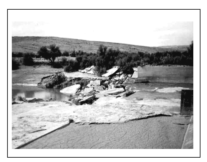
Photograph 3. Deliberately destroyed diversion weir in Anambar Plain, Pakistan: ours, 1997

As to the example from Pakistan, in Anambar Plain in Balochistan, one of the introduced modern weirs significantly changed the indigenous water distribution system. The weir was constructed to divert spate flows to upstream fields. It performed this function, but also considerably reduced the base flow to the downstream fields. This deprived the downstream farmers of their basic access to water granted to them by the water rules that had been implemented for years. Essentially, the design was made with a major oversight as to the prevailing water distribution rules. Hence, the weir became the main cause for many tensions and conflicts. Unlike in the Yemen case, the upstream community, faced with an equally socio-economically powerful downstream community, did not manage to maintain the water control power offered to it by the weir and did not shift from food crops to highly profitable commercial crops. As conflicts became unbearable, the two communities - in harmony - reached a mutual agreement - they purposely blew up the weir (see Photograph 3) and returned to their indigenous structures and water sharing arrangement.