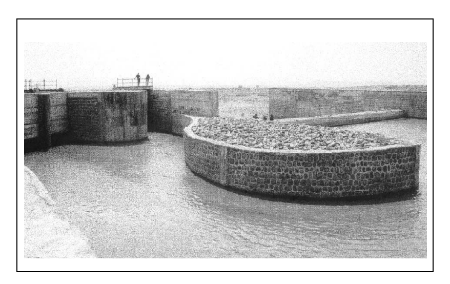
Photograph 2. Section of Wadi Laba diversion weir: ours, 2003

To provide another example from Wadi Laba, the structural modernization that was completed in 2001 replaced the flexible main indigenous structure (see Photograph 1) with a rigid permanent weir (see Photograph 2), and many other secondary earthen distribution structures with gabion.